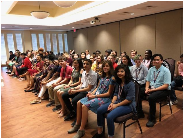
INNOVATION EARLY COLLEGE HIGH SCHOOL, GREENVILLE, NC