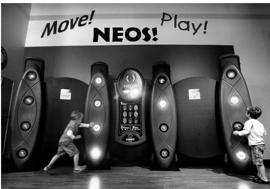
One of the exhibits we added in 2009: NEOS!