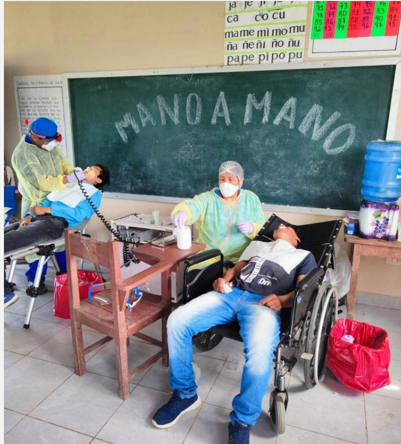
A weekend health clinic in November 2021.