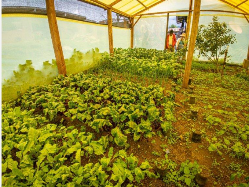
One of Mano a Mano's new greenhouses in Corani Pampa.