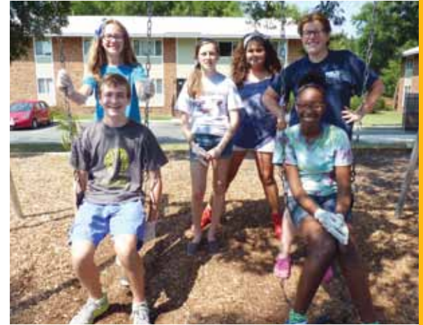
HandsOn Greater Richmond's Teen Impact volunteers at North Oak