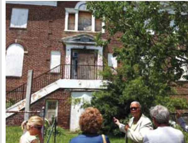
First look at the Citadel of Hope building on Venable Street