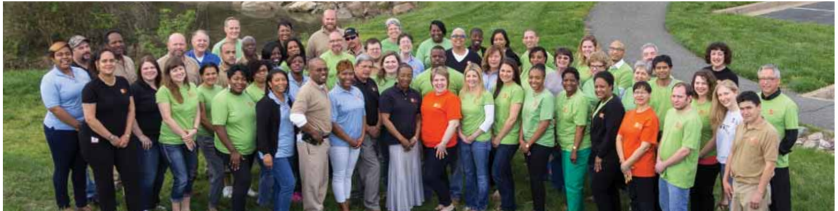
The BHC family

We have taken great care to ensure the accuracy and completeness of this list, and regret any errors or omissions.