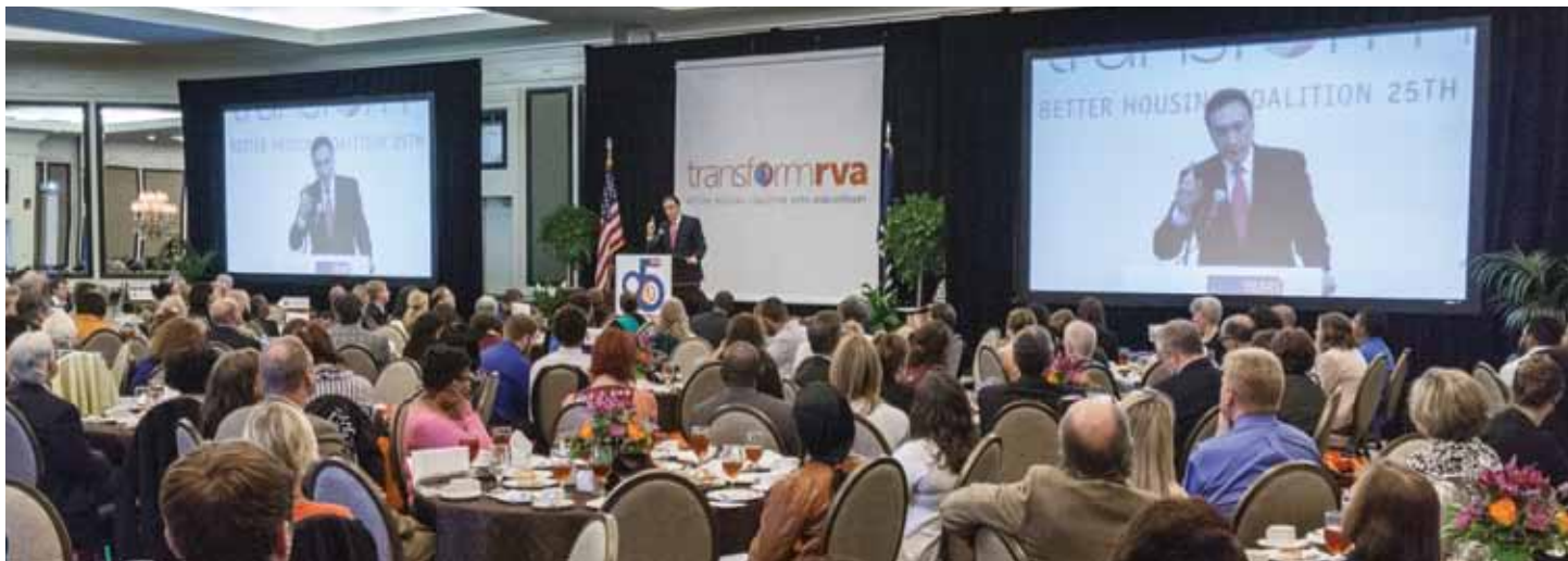
The Honorable Henry Cisneros addresses the TransformRVA crowd

On May 21, 2015 more than 300 enthused individuals celebrated BHC's 25th anniversary during TransformRVA at the Omni Hotel. During the full-day event, we acknowledged past accomplishments, renewed BHC's commitment to meaningful community investment and invited attendees to find authentic ways to engage in bettering their communities.