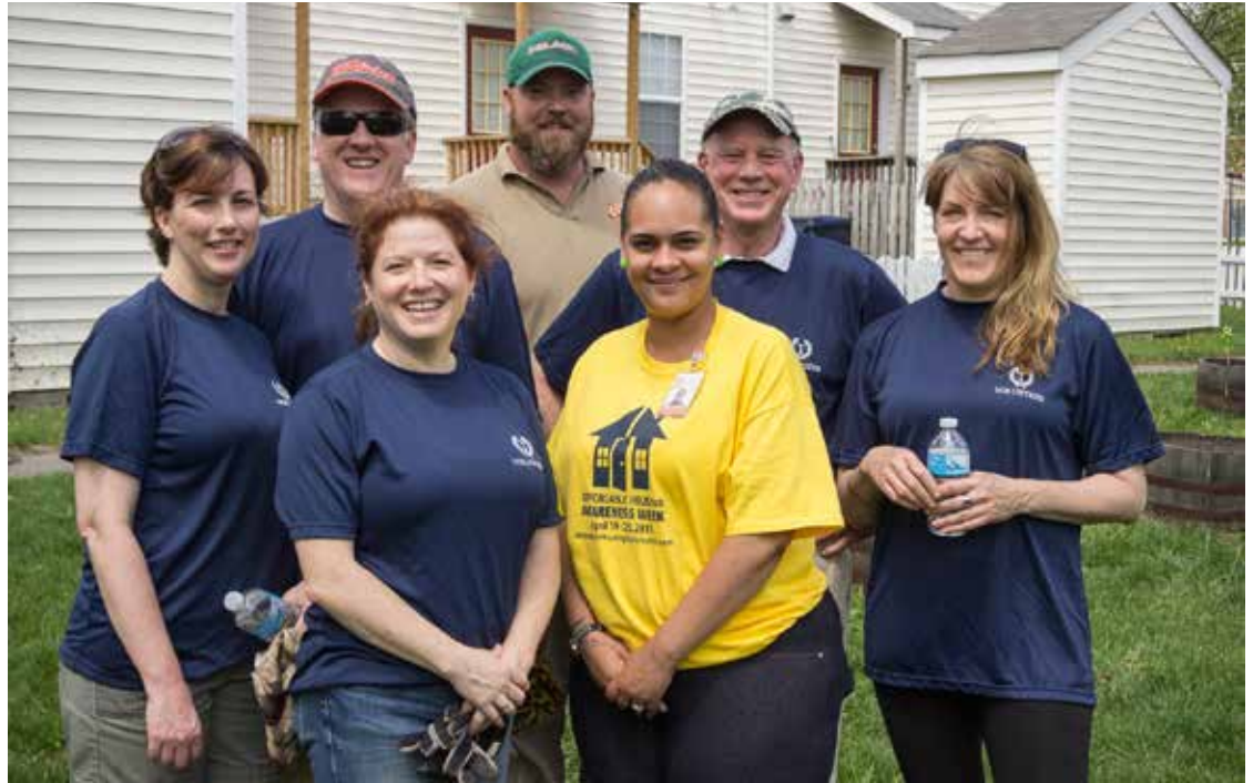
TowneBank volunteers at Winchester Greens during Affordable Housing Awareness Week