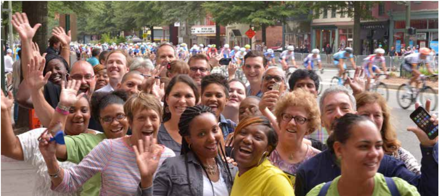
BHC staff cheer as the UCI Road World Championships cyclists pass by the main office

The Better Housing Coalition builds opportunities for people and communities. While our primary lines of business involve bricks, mortar and construction, our ultimate goal is to create a pathway to better choices and brighter futures for those who call RVA home. We can make it happen, together.