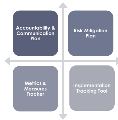
Figure 1.3 Accountability & Finalization Plans & Tools

To ensure successful implementation of the detailed action plans produced in the planning phase of this process, Bloom worked with Beyond Literacy’s pillar captains on a series of accountability activities including the creation of the Intra-Pathway Monitoring, Cross-Pathway Monitoring, & Macro Plan Monitoring approach, which is included in the final presentation and report. In addition, the rollout plan for the Beyond Literacy community to learn about the strategic plan prioritizes clear messaging, broad reach, and maintaining momentum.