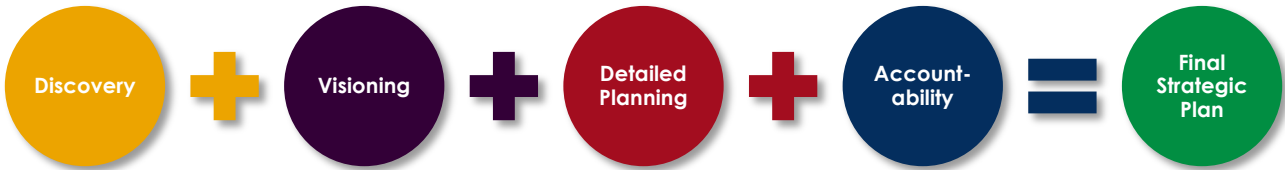
Figure I.1 The Five Phases of Beyond Literacy’s Strategic Planning Process

Beyond Literacy developed this strategic plan using a five-phase planning process.