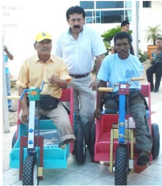
Lives changed in Ecuador.

Our Mission: Reflecting the love of God by bringing the gift of mobility and dignity to those in developing countries who are unable to walk. Your generosity supported three main objectives: distribution of carts with international agencies and sponsors, coordination of production sites and the promotion of Mobility Carts among supporters.