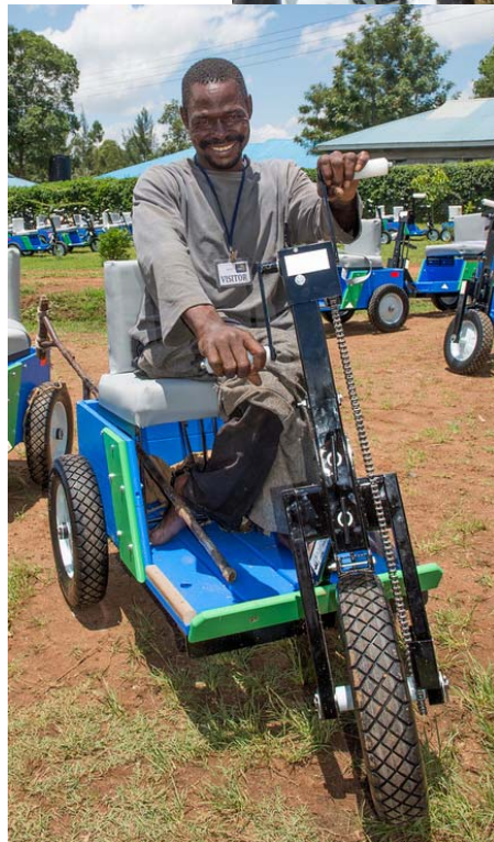
This man receives one of #145 PETs distributed on this day.