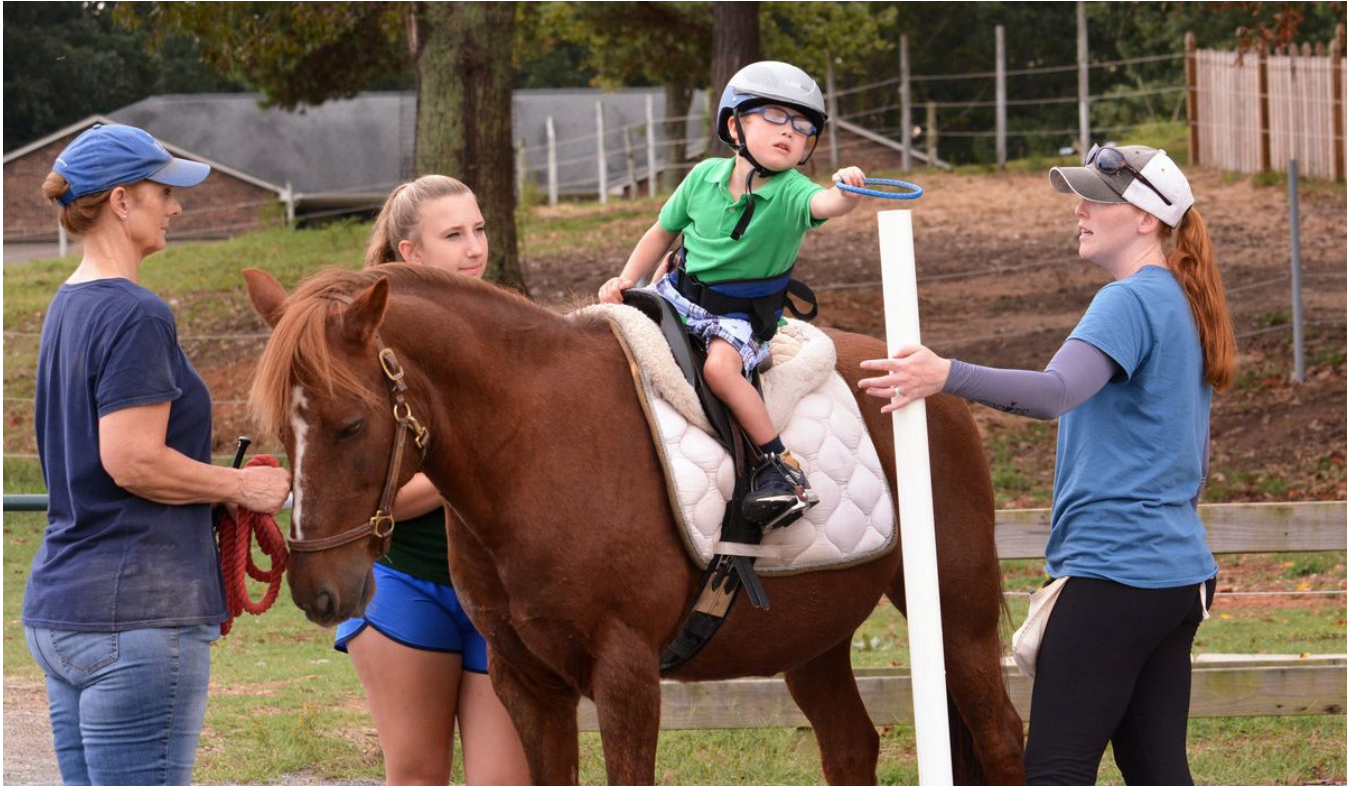
October 24, 2016