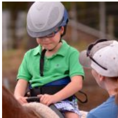
( http://lifestylepubs.wordpress.s3-us-west-2.amazonaws.com/app/uploads/prod/2016/10/SB1_5845.jpg )